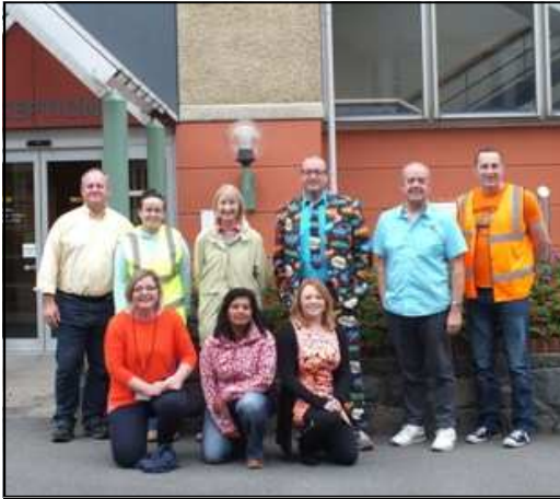
Frossard House staff get into the spirit of “Bright Day”

Our annual dress down day, “Bright Day”, was held on 28 th October this year— just before the clocks go back at the end of summertime.