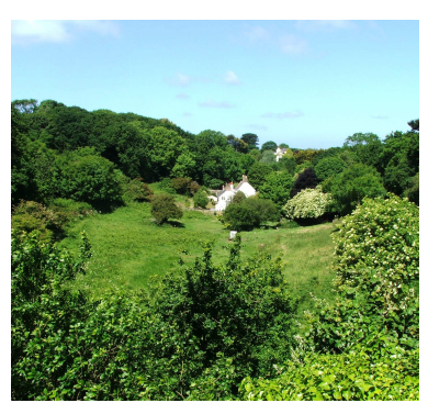
View from Rue de Quanteraine