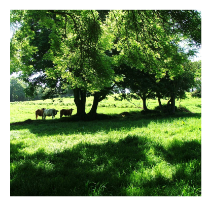
La Vassaleríe, St. Andrew