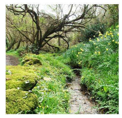
Les Rebouquets, Forest