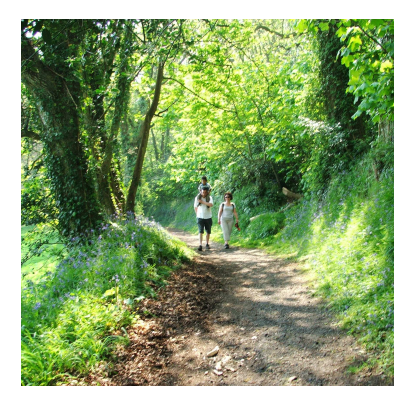
Rue Paíntaín, Castel

Inside each card there is a sketch map of a walk linked to a local pub, café, restaurant, or hotel where you can stop off and enjoy Guernsey's local cuisine. The cards are blank so that you can use them for any purpose.