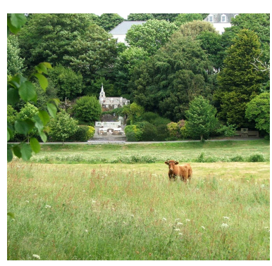
Líttle Chapel, St. Andrew