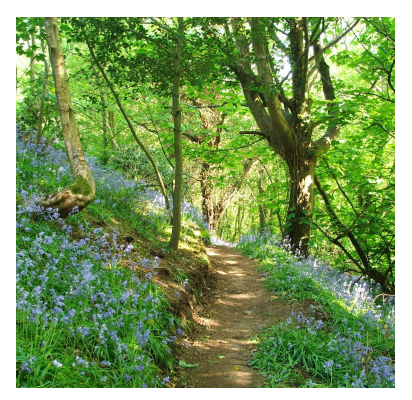
Moulín Huet Valley

See over for an example of the inside of one of the cards and prices \longrightarrow