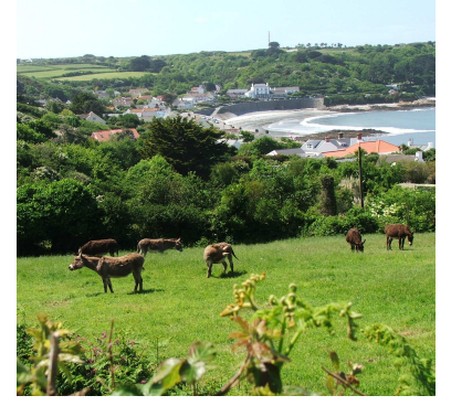
St. Píerre du Boís view