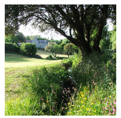
Rue des Clercs, Torteval