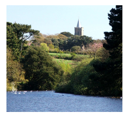
st. Savíour's Church